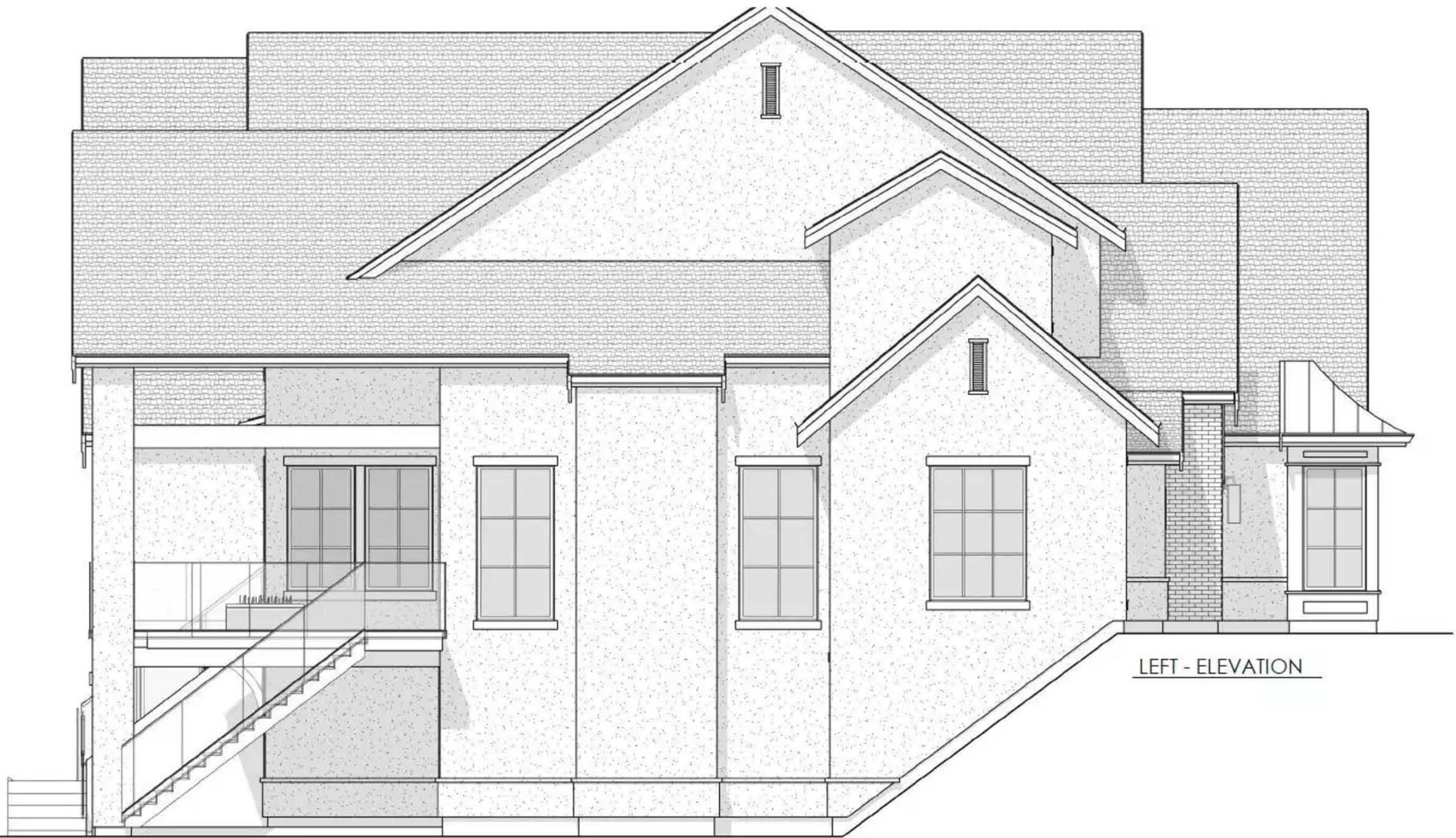
LEFT - ELEVATION