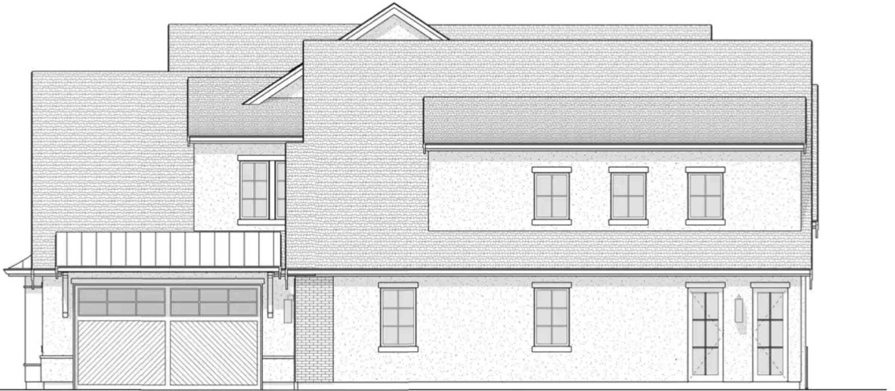
RIGHT - ELEVATION