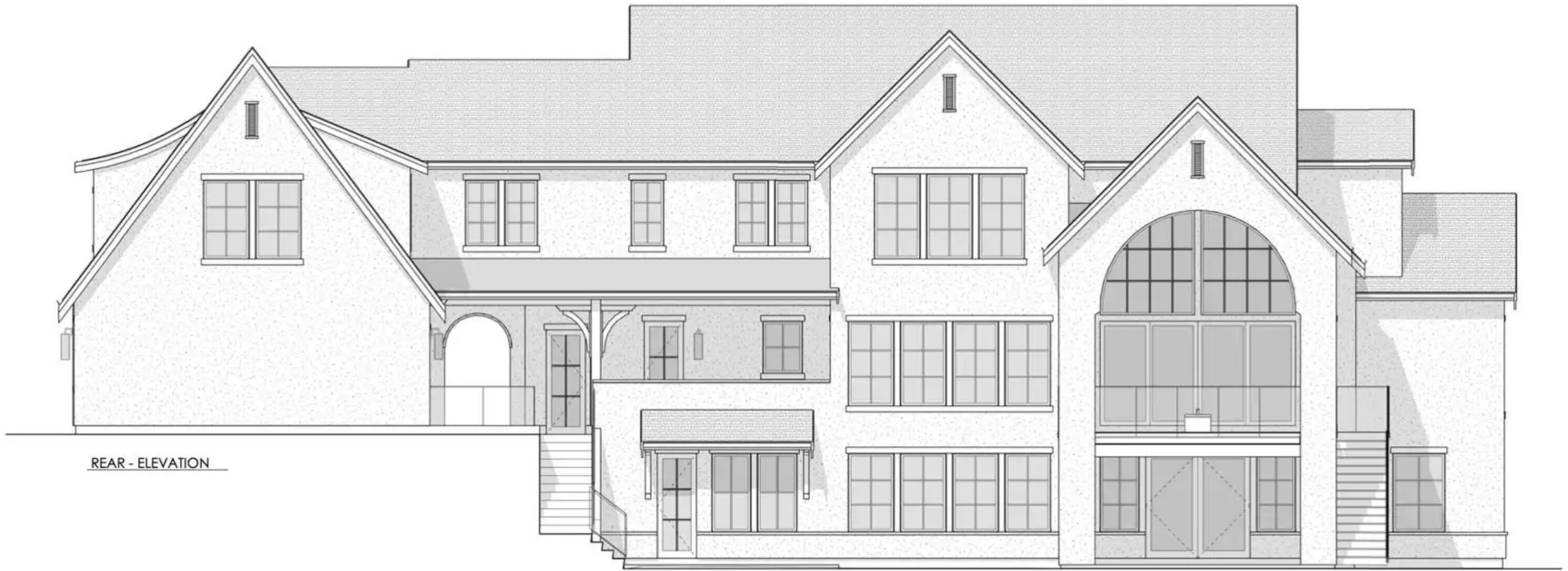
REAR - ELEVATION